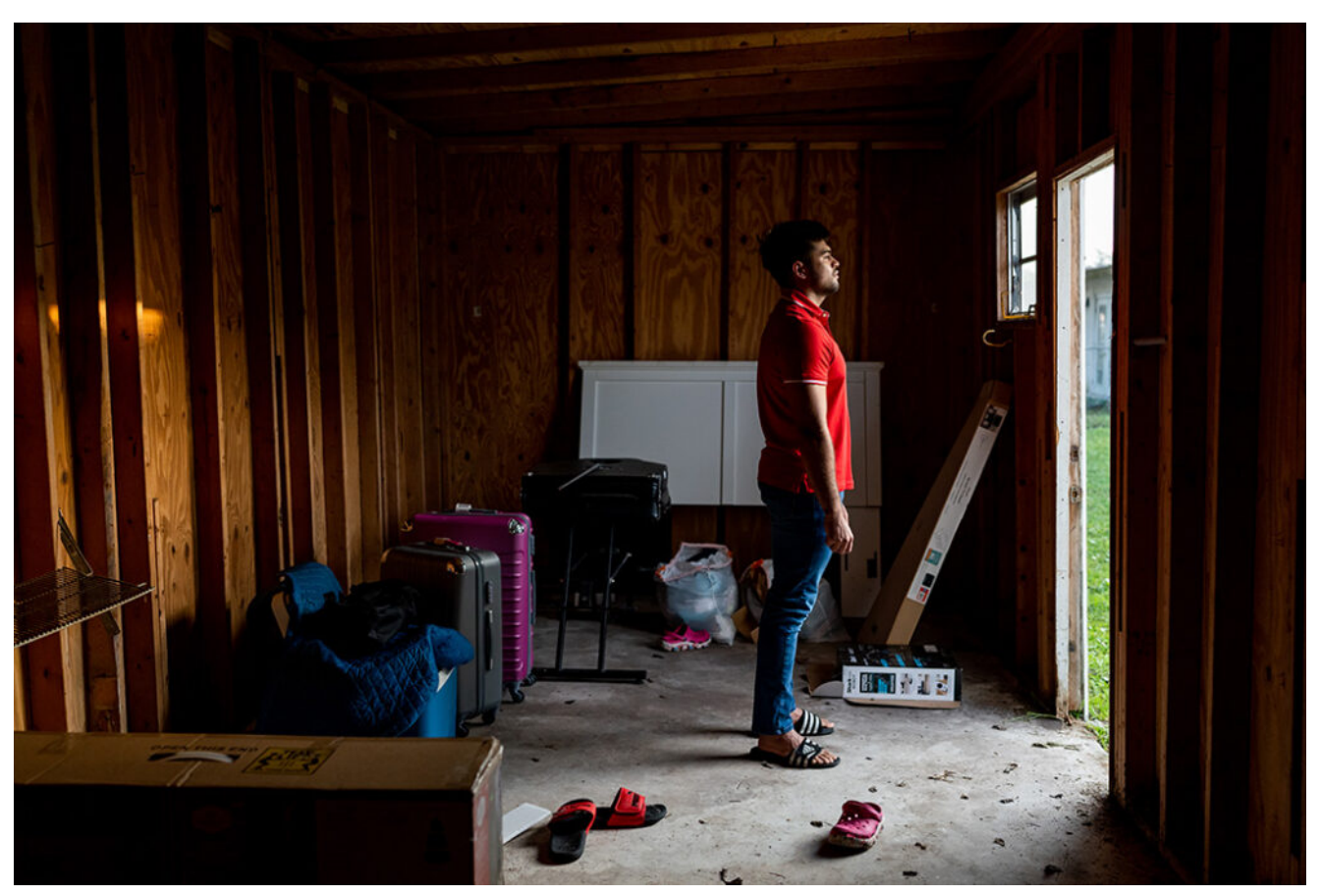
Put your add code here

Karen's upcoming show at Sarasota Art Center is an exploration of personal stories of local Hispanic individuals and their journey battling with Mental Health and Mental Health Care. Mental Health is highly stigmatized within the Hispanic community due to immigration, religion, and personal relationships. These photographs shed light on the struggles endured, and open up conversations about Mental Health and Mental Health Care, both within and outside of the Hispanic community. It is important to have these conversations, to better understand the Hispanic culture and their needs as part of this society.