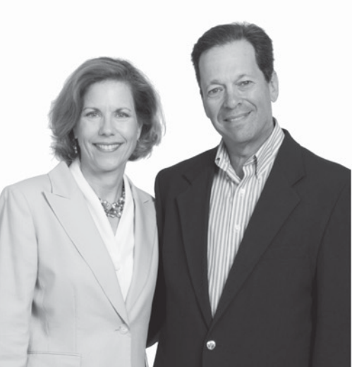
AGENDA FOR IMPACT / TWO THOUSAND FIFTEEN / 45